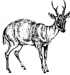
Muntjac: the male emits frequent barks to warn other animals of danger.